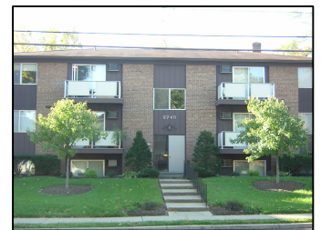
The Observatory Hyde Park Square (1.5 blocks)

2743-5 Observatory Avenue, Cincinnati, Oh 45208